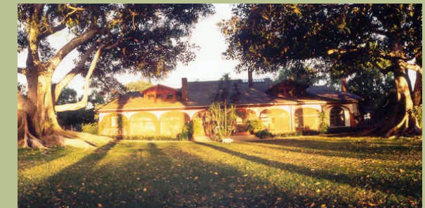
The ranch house