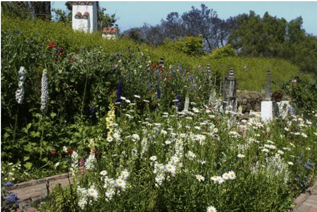
The Cutting Garden at Rancho Los Alamitos